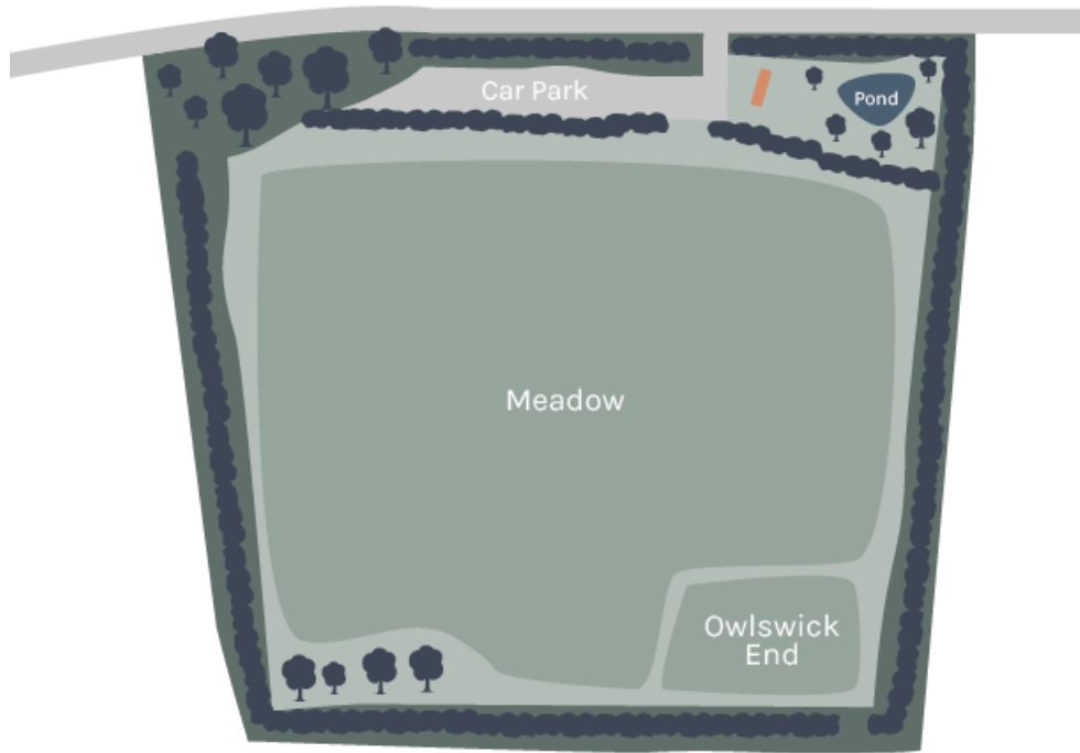
Aylesbury Vale Area Plan

Price List - Valid from 1 April 2026 - 31 March 2027